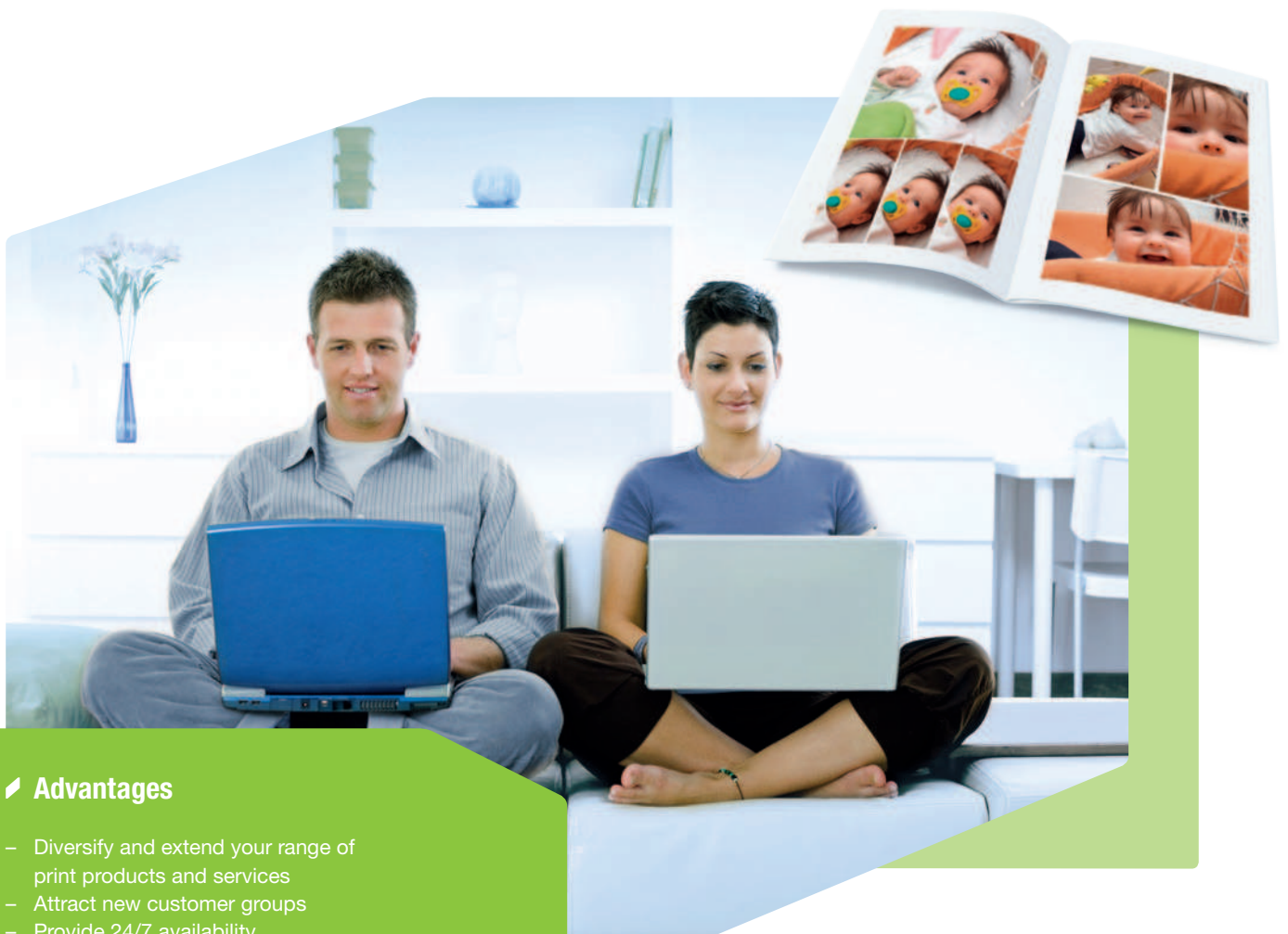
Photo book creation is an easy and attractive enhancement of your online print offering. Via a photo book application, you provide your customers with easy yet extensive online layout possibilities to create albums or calendars with their photos of holidays, events and other occasions. Similar to other web-to-print applications, photo book software includes online submission, payment and tracking, right down to the final delivery or collection of the printed photo book.

“Expand your services and grow your revenue.”